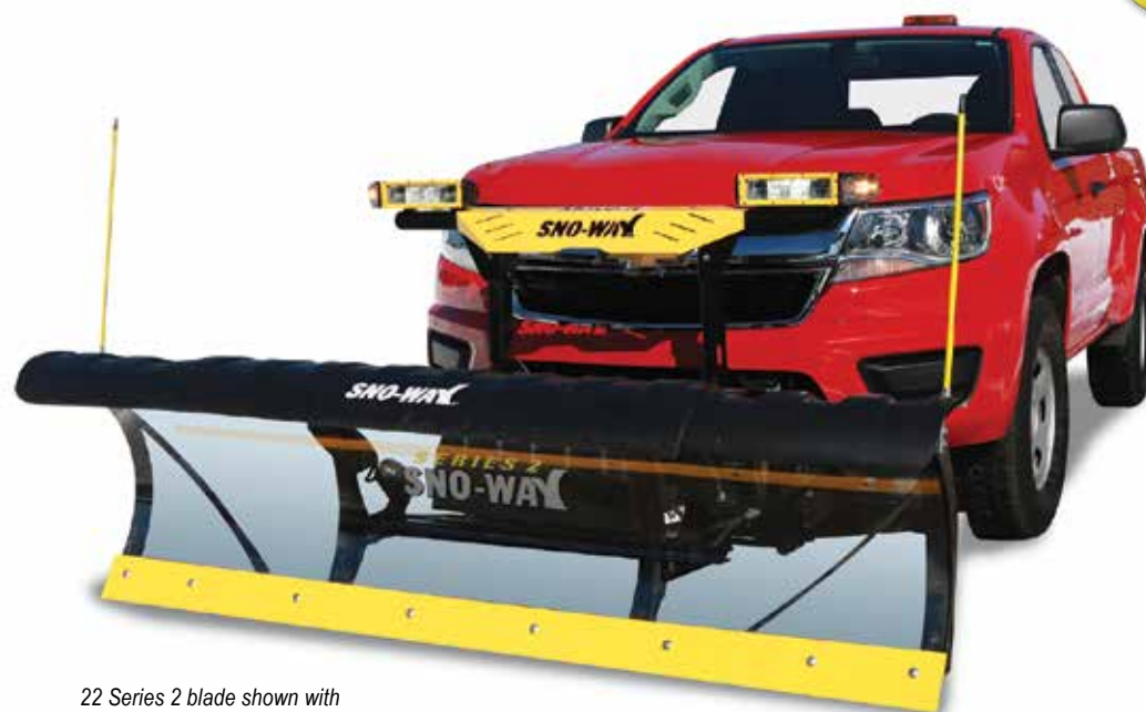
22 Series 2 blade shown with optional deflector

** Optional Auxiliary Light not for highway use