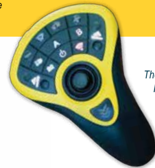
The wired or wireless ProControl™ 2 Plus allows for easy one-touch button control.

* Plow weight does not include weight of vehicle mount