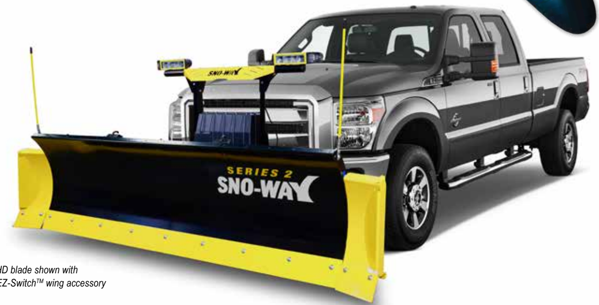
29HD blade shown with 9" E-Z-Switch™ wing accessory

The wired or wireless Pro Control 2 Plus allows for easy one-touch button control.