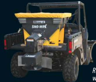
RVB10 shown with short chute