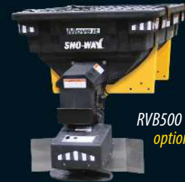
RVB500 Shown with optional 16" Chute