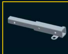
UTV Receiver Mounting Bracket