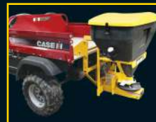
UTV Spreader Bed Mount