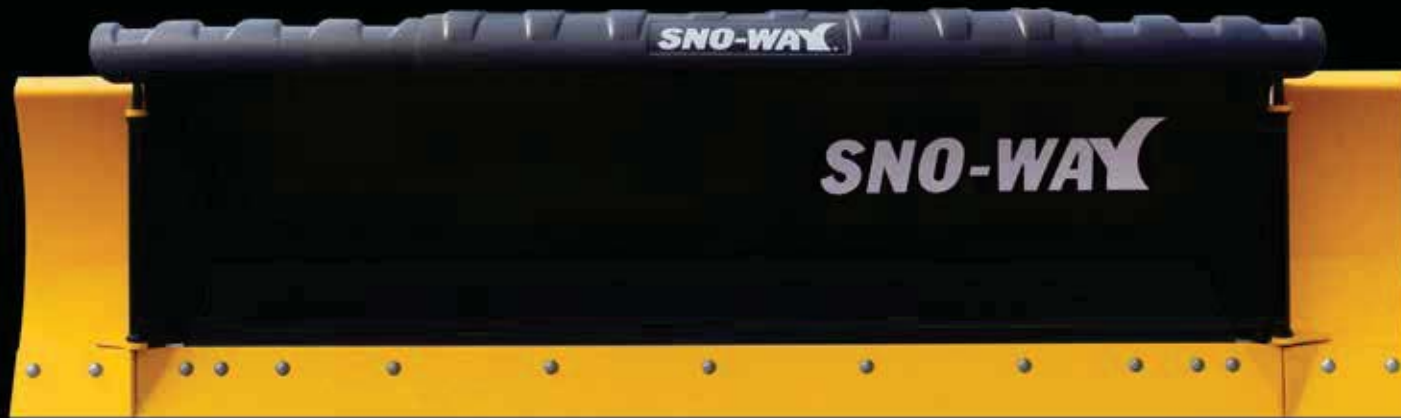
29R Series is shown with the optional E-Z Fit Deflector