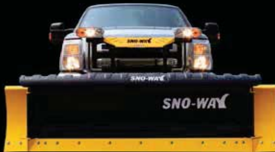
29R Series is shown with the optional E-Z Fit Deflector

The 29R stands out from the crowd with the greatest possible snow moving flexibility and capacity for your plow truck. No more machine limitations! The “R” in the model identifier refers to the Revolution series of plows. These plows are designed with patented hydraulic end wings that can be controlled together or independently to move the snow where you want it at any time. Each wing can be moved from a straight out position into a 90 degree orientation to the main blade – effectively creating a box plow. This patented dual-hinge plow design provides you the ability to move up to 4.8 cubic yards of snow which is double the closest competitor’s V plow or expandable plow! Engage the Patented Down-Pressure® Hydraulics System that increases snow moving capacity another 30% and you have the ultimate snow clearing machine.