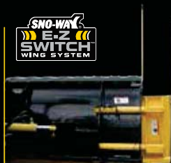
The built-in mounting system for the E-Z Switch™ Wing System allows you to add accessory wing options that can more than DOUBLE your snow moving capabilities