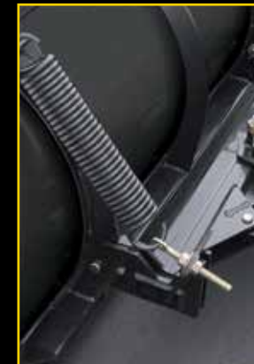
Full Load Trip Springs