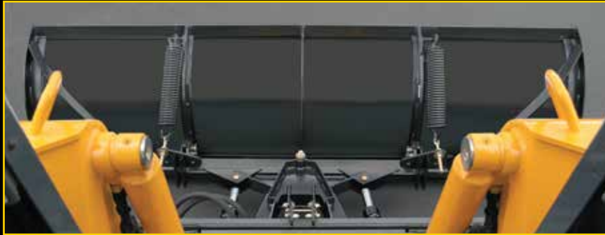
22SKD Shown for Informational Purposes

Available in 6'-8" and 7'6" – The 22-26SKD Straight Series Snow Plows provide efficient snow rolling and world-class durability.