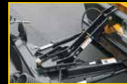
A-Frame Float Linkage