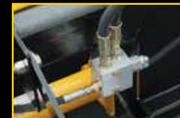
Angle Cylinder Crossover Relief Value Block