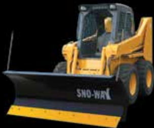
Shown with 26SKD