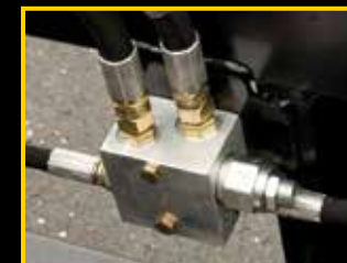
Angle Cylinder Crossover Relief Block