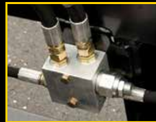
Angle Cylinder Crossover Relief Block

The built-in mounting system for the E-Z Switch™ Wing System allows you to add accessory wing options that can more than DOUBLE your snow moving capabilities. Image shows the mounting system and 9" wings on the 29HDSKD.