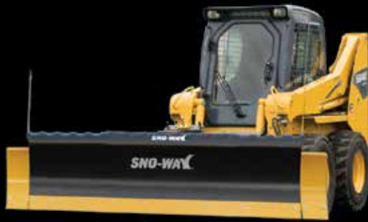
Shown with optional 9" E-Z Switch™ Wings and optional E-Z Fit™ Snow Deflector.